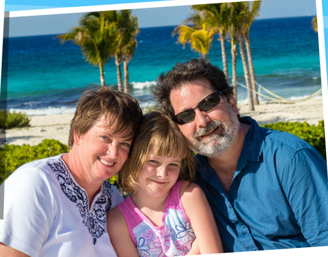
I love my parents for taking good care of me and for loving me even when I had a bad day.