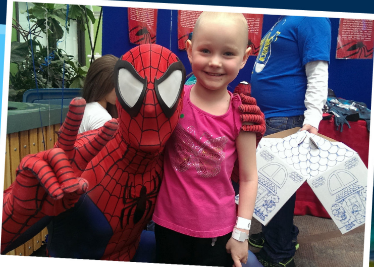
Having leukemia was tough and I am lucky that I was able to beat it.